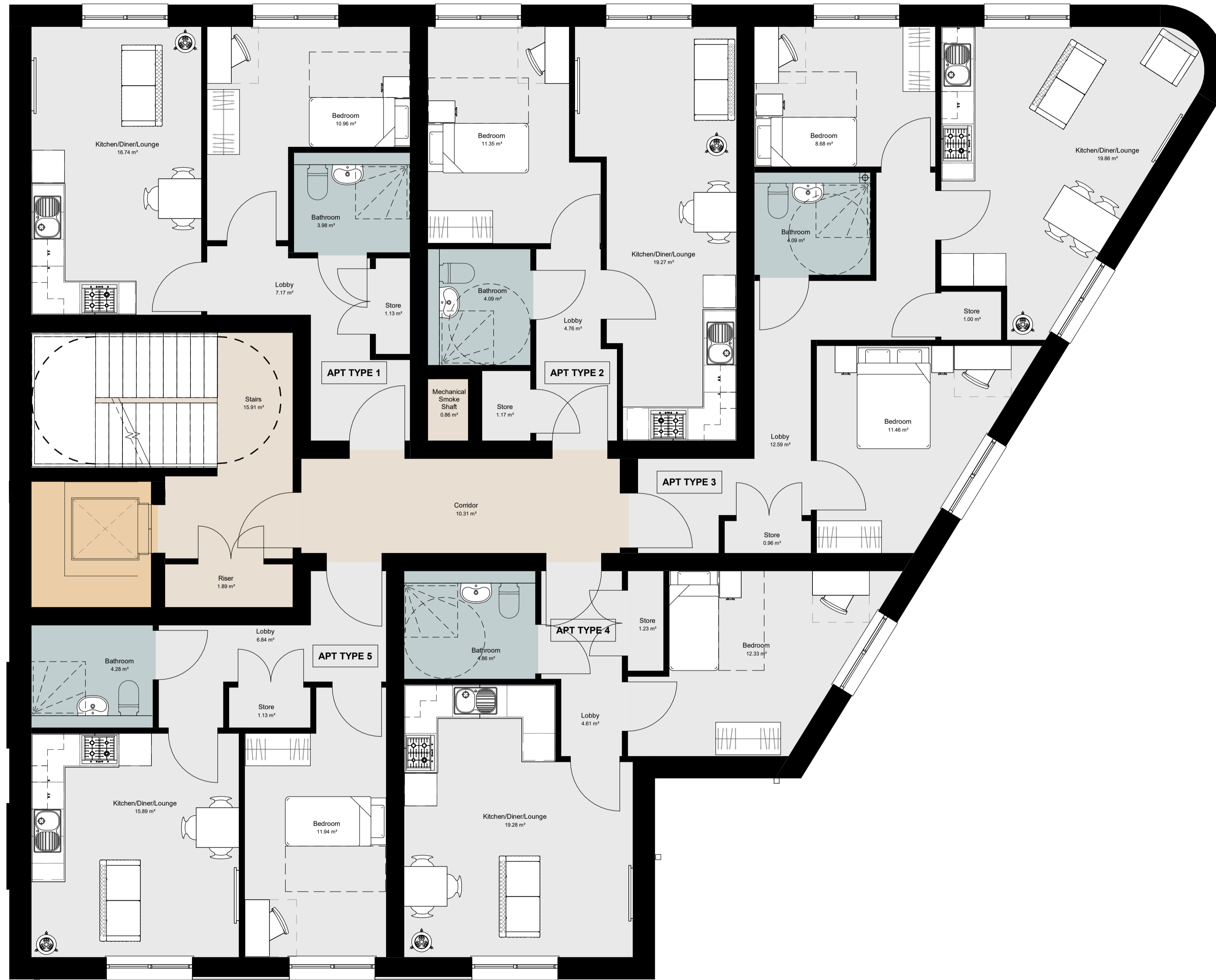
Proposed 02 Second Floor Scale @ 1 : 50